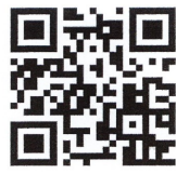
New Hope Ministries