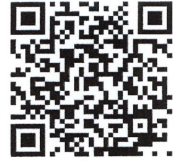
Guthrie Memorial Library - Hanover

Guthrie Memorial Library Hanover- Shelter & Education 2 Library Place, Hanover, PA 17331 717-632-5183 **Scan QR Code for website** Mon-Wed- 10-8 Tues- 10-6 Fri & Sat- 10-5