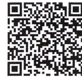
Changing Lives Shelter